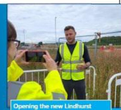
Opening the new Lindhurst Spine Road that unlocks a £250m investment in Mansfield

It's brilliant to see Mansfield increasingly popular with those who want invest their money, whether its new jobs and businesses, housing or other infrastructure. The Lindhurst Project is a £250m injection in to our local economy that will provide homes and jobs, as well as a school. We've also had over £30m private sector investment in our town centre.