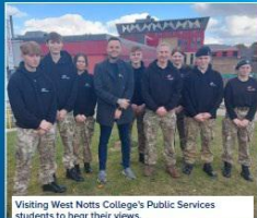
Visiting West Notts College's Public Services students to hear their views.

I'm passionate about supporting young people, and one of my major projects currently is pulling together a partnership and a bid for new youth facilities in Mansfield. I want to provide new support and services to those who most need it - watch this space!