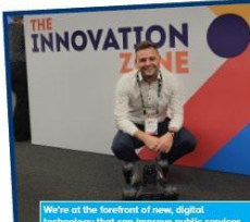
We're at the forefront of new, digital technology that can improve public services.

I'm pushing for our area to lead the way on new innovation and better public services.