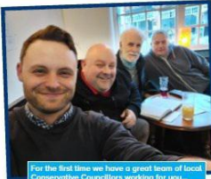
For the first time we have a great team of local Conservative Councillors working for you...

I've been working with our excellent new team of Conservative County Councillors, to make a difference in our area.