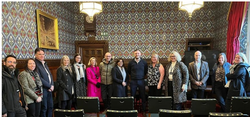
Meeting with Council officers in Parliament

Pleased we're delivering on the PM's promise to prioritise the NHS and cut waiting lists, with one of the fastest improvements in emergency waiting times in the history of the NHS, making sure people get the care they need easier, faster, and closer to home.