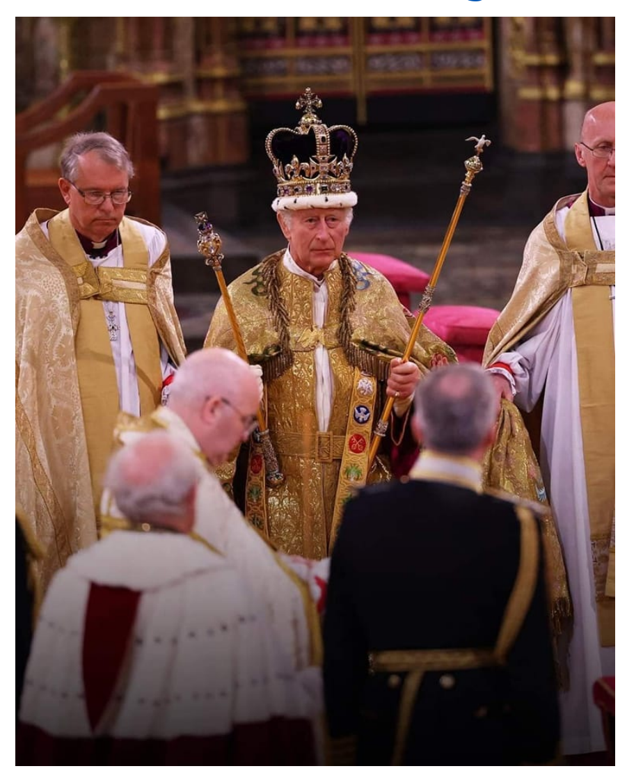
On an historic day for Britain,