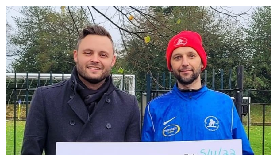
More funding for local clubs!

For all the time pressures and stresses of the job, those days when I can get out and chat with residents across our community are still my favourite days!